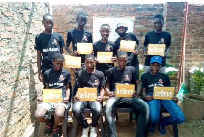
Trailblazers boys club