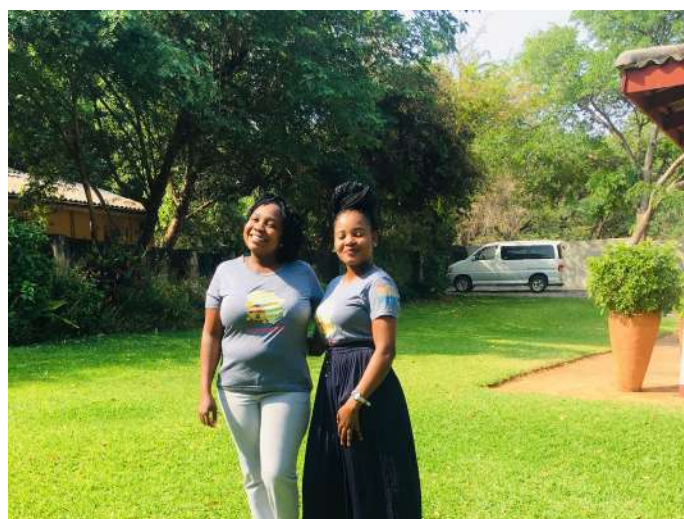
Mentors Procedure and Mercy