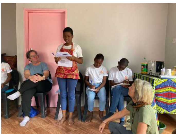
Our safe space is coming together bit by bit and the girls are grateful for this lovely space to share and learn