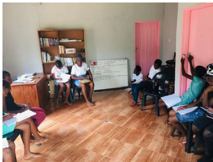
So grateful for our space facelift..Paintwork. Here we hosted some visitors,we shared a lot of what they participated in our session.