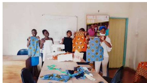
Sewing session :Girls making Aprons