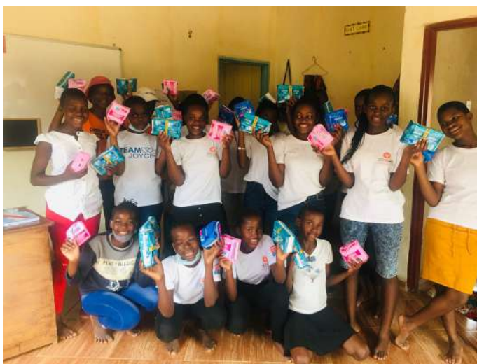
Menstrual hygiene day