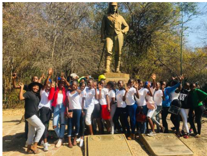
The 2022 conservation activity where girls and boys learnt about the importance of conserving the environment and also about careers in tourism