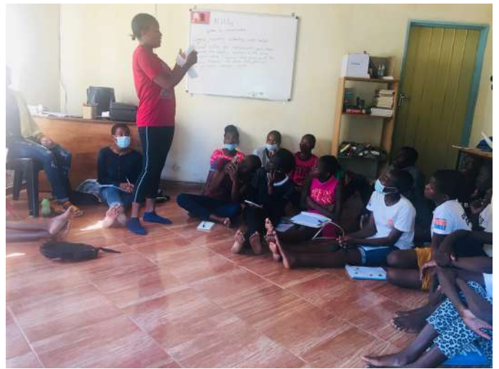
Club session with girls sharing their menstruation experiences